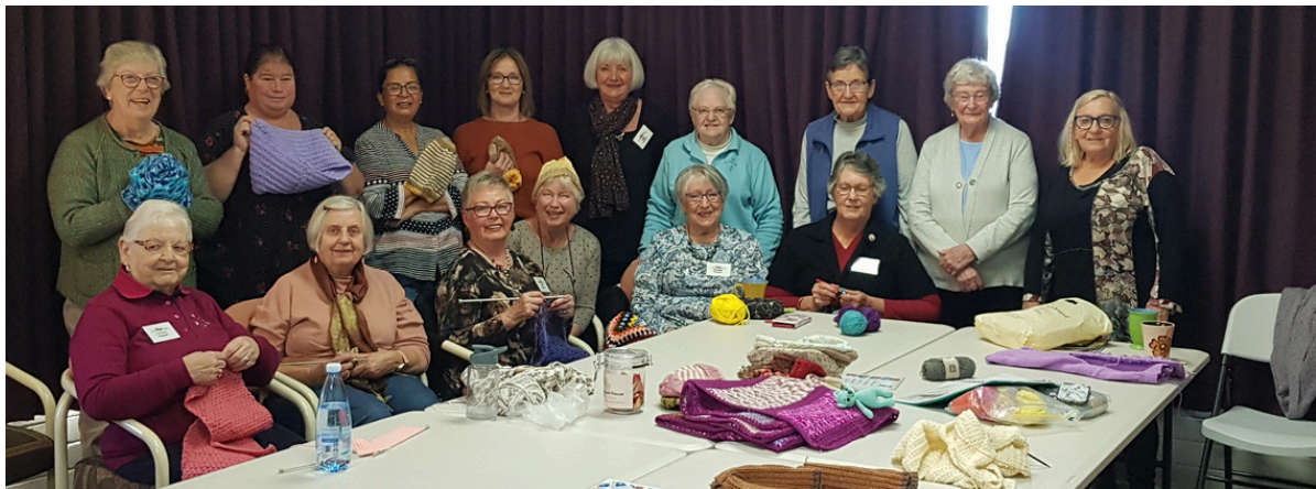
Poppy Creators Community Knitting Group